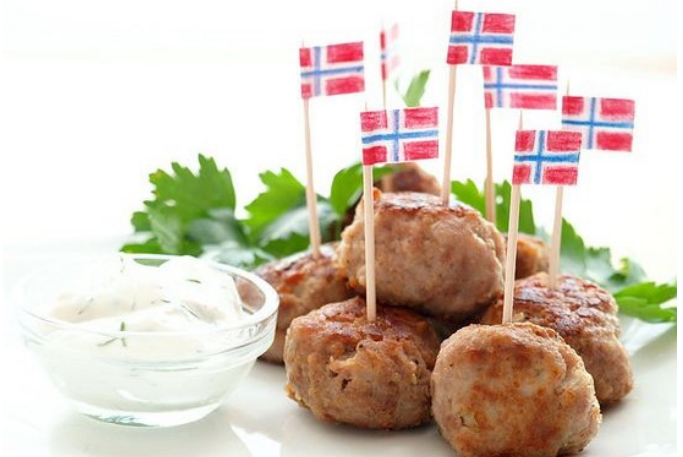
Whether you like to cook 'em, or just eat 'em, Memorial Day Weekend will be "Meatball Weekend" at Camp Norge!