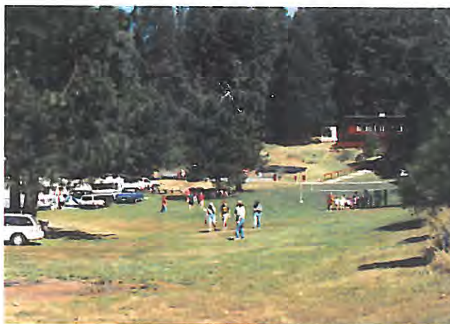
The meadow at Camp Norge: It offers RV camping, a place to play games, to picnic, to enjoy the beauty of the hills.