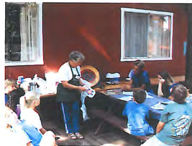
Each summer, a prime use for the camp is to serve as the home for the 6th District's Language & Heritage Camp.