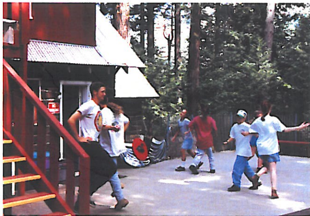
Folk dancing by the main house—among the pines at Camp Norge—during Language and Heritage Camp.