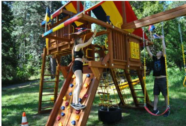
Finishing touches May 12, 2021