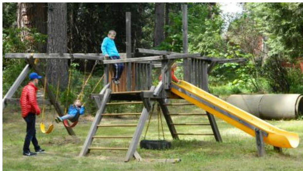
Memorial Day 2018